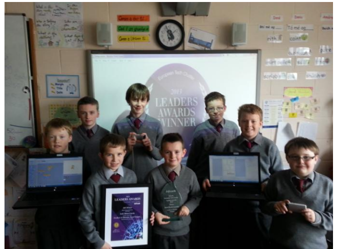
Proudly displaying our 'Excellence in Education Award'

Scoil Mhuire Lourdes embarked on an overhaul of the use of technology in the classroom a couple of years ago so as to provide our students with a more structured approach to learning IT. This coincided with the beginning of a European Comenius IT based Project, with schools from Belgium, England, Germany and Sweden. We offer a variety of technologies such as Scratch programming, Comic Life, stop/start animation, podcasting, and much more. Our students should be competent in a number of IT areas by 6 th Class. We were delighted to get a nomination for the it@cork "Excellence in Education Award" which is open to all primary and secondary schools in Cork. Despite very stiff competition we were shortlisted to the final three. Much to our delight, we were awarded first place! We are delighted to have recognition of our teachers' and pupils' hard work and will continue to keep ahead of the curve with IT in schools and are looking forward to purchasing VEX robotic equipment in the near future.