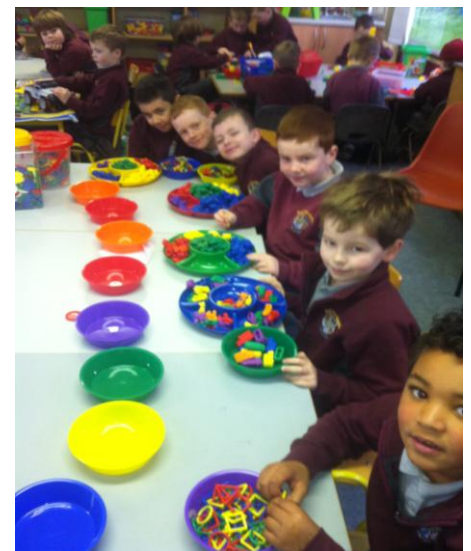
Senior Infants using their new Maths Equipment