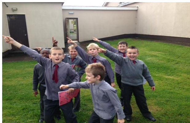
Budding Einsteins checking wind direction Science in Fourth Class