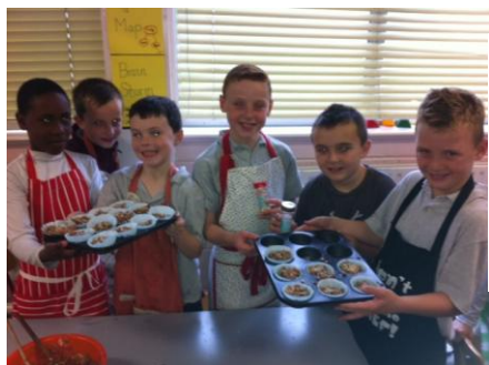
Carrigaline's Great Bake Off

We enjoyed great success in Chess again last year. We currently have over 40 members in our chess club. We practice each Wednesday after school. The focus is on participation and enjoyment but we are also very competitive. We will take part in the Cork Leagues and hope to enjoy even more success this year.