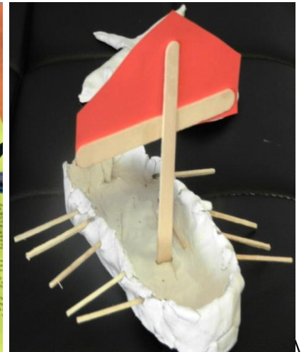
Above: 4th Class worked hard on their History projects.