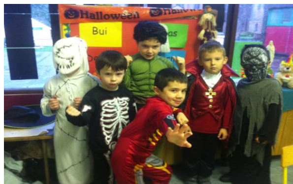
Halloween in our Infant School

To view more pictures from Scoil Mhuire Lourdes and to find information on other activities in the school visit www.scoilmhuiRELouRdes.ie