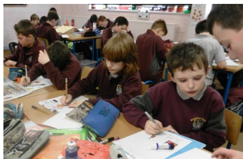
Busy at work in 4 th Class

We are working towards our Fourth Green Flag. Our aim is to reduce our Carbon Footprint. Our goal is to encourage more people to walk, cycle or carpool when coming to school.